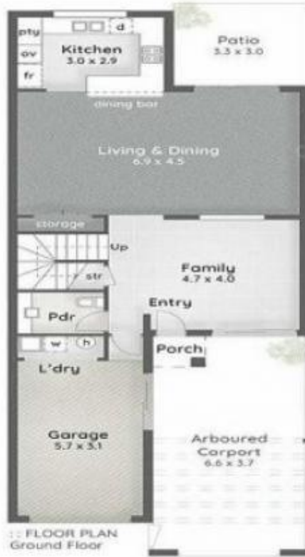
:: FLOOR PLAN Ground Floor