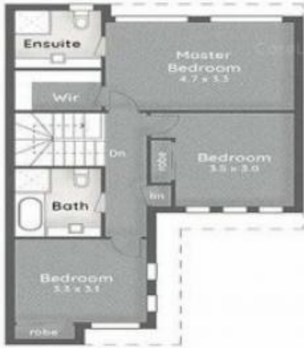
FLOOR PLAN First Floor