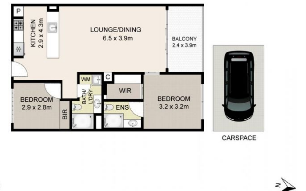
Approx internal Area 78m<sup>2</sup> Approx Balcony Area 10 m<sup>2</sup> Approx Total Area 88m<sup>2</sup>