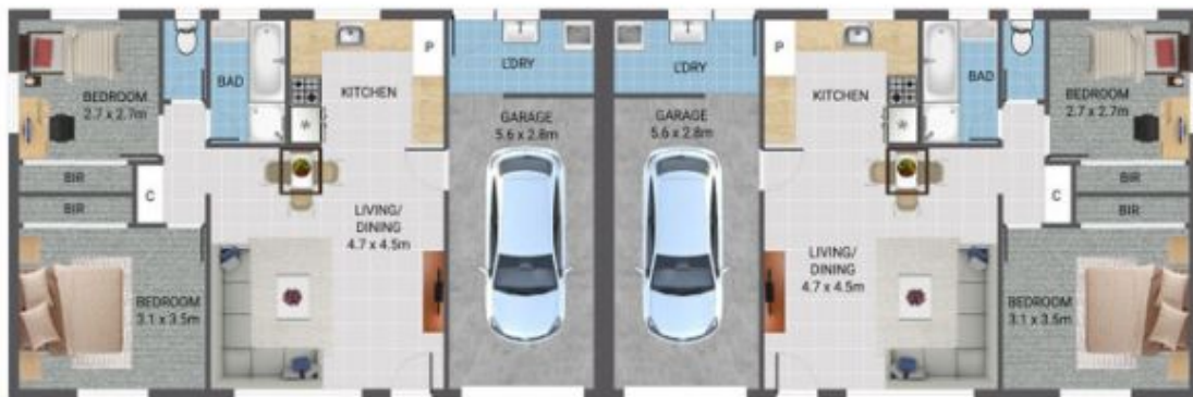
2/4 Heffernan Crescent