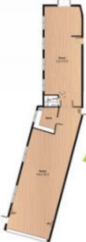
MAIN RESIDENCE (SECOND FLOOR)