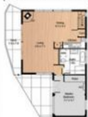
GARASU LODGE (GROUND FLOOR)