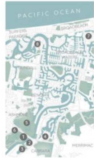
104 LOCATION MAP